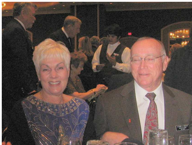
The Bowlers at the USPS Change of Watch dinner.

All these things cannot be accomplished without- COMMUNICATION, COMMUNICATION and COMMUNICATION!