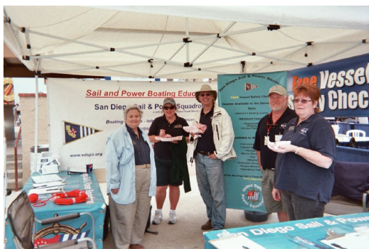
Booth at San Diego Fair